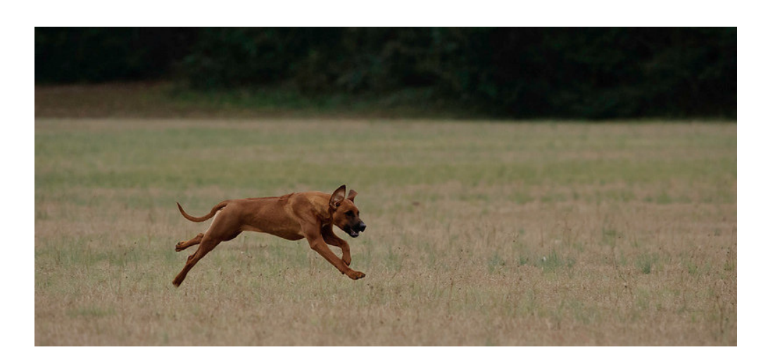
Highveld's up and coming star Bindi (7 month old Highveld's The Middle Path )

At the Afghan Hound Club of America lure coursing trial (Camden, SC) on December 11, 2010, Reign Beau earned a Best in Field.