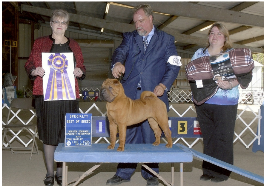
GCh. Jade East Do You Know The Way To San Jose