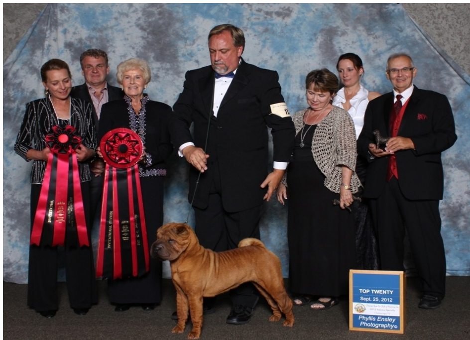
GCh. Jade East Do You Know The Way To San Jose