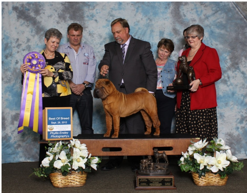
GCh. Jade East Do You Know The Way To San Jose