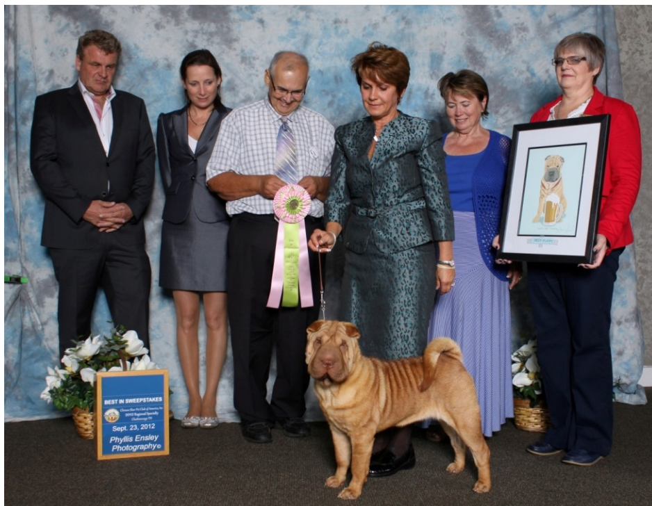
Jade East Dancing Through The Milky Way