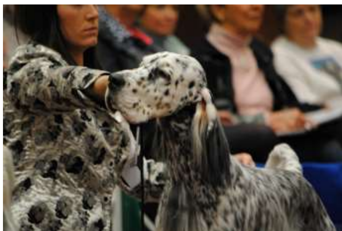
CH NORTHWINDS JUST JACK at the 2013 ES National in Huron, Ohio