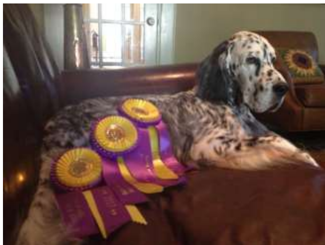
Just Jack finally home after being away for months! Taking a well deserved rest and sporting his favorite color purple!!!