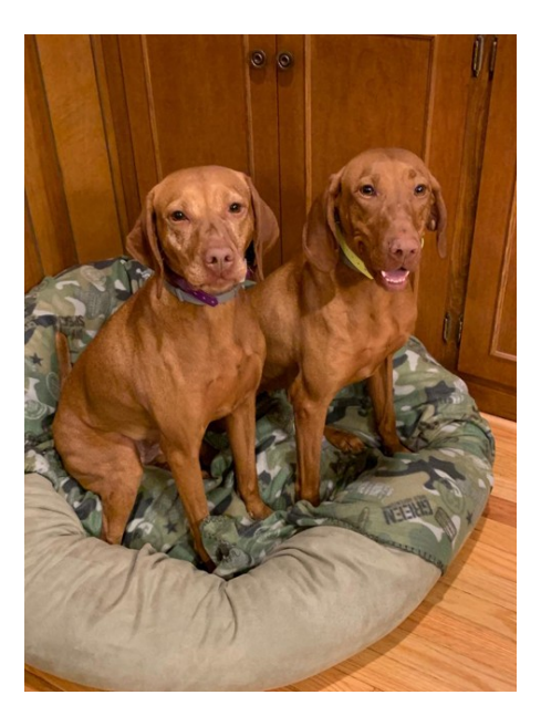
Working on Bed, Stay! Violet and Carly Tyner