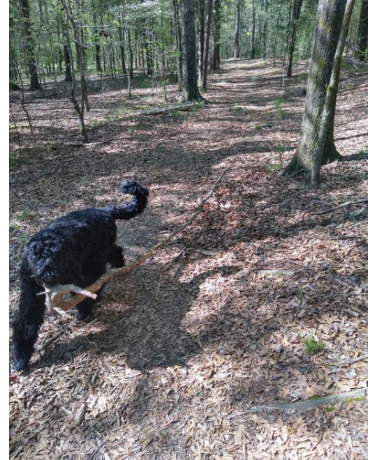
Kurgan assisting with clearing brush Deborah Craddock