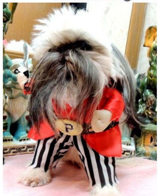
Sterling is suited up, protecting our house from the virus. Debbie Miller