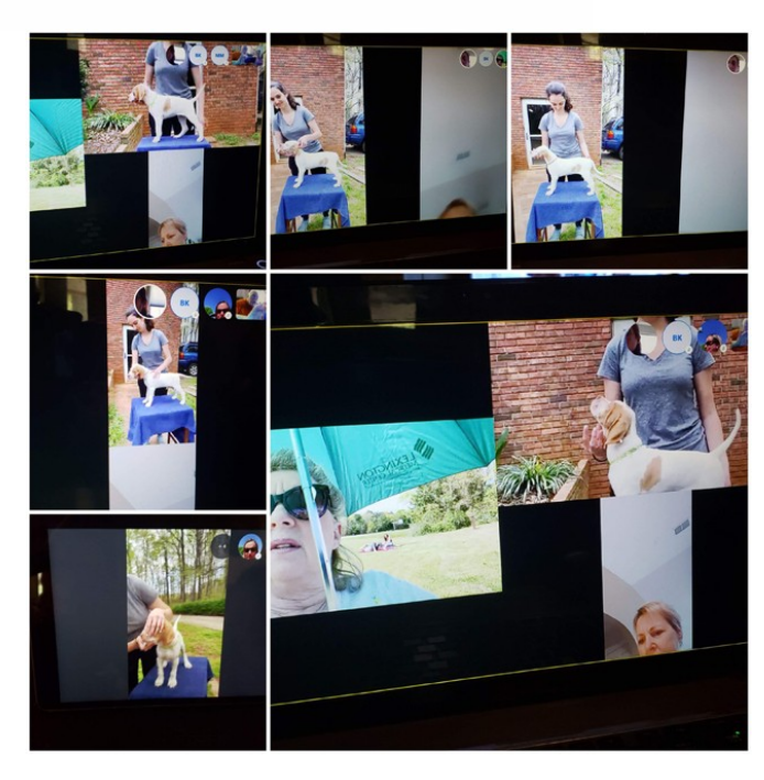
Social Distance Puppy Evaluation via Zoom