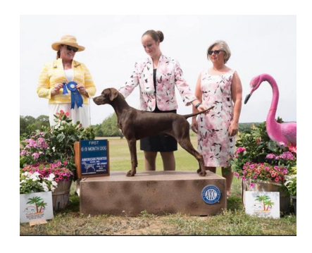
Trout Wins the 6-9 month class and was considered for winners dog! So proud of my baby boy!