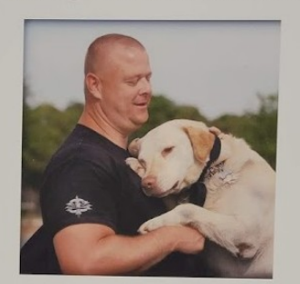
Presented by Greenville Kennel Club