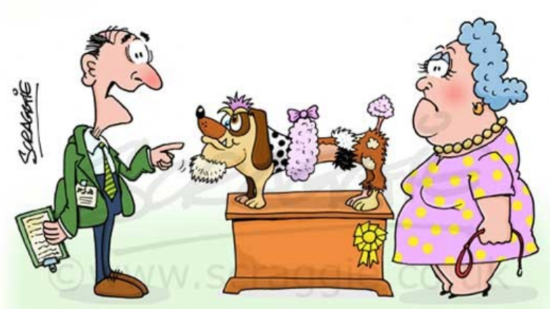
"I suggest you reconsider your approach to responsible dog breeding"