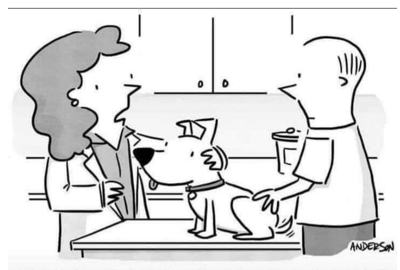
"The barking could be boredom, fear, separation anxiety, or just wanting attention. But most likely it's because he's a dog." -aminus Cife-