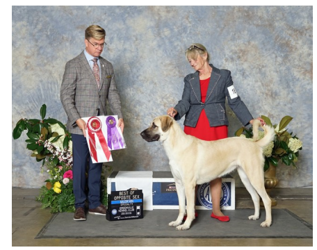
This was the ASD Regions BOB. GCHS CH Full Circle's Bruichladdich Black Art FDC THDN CGC TKN