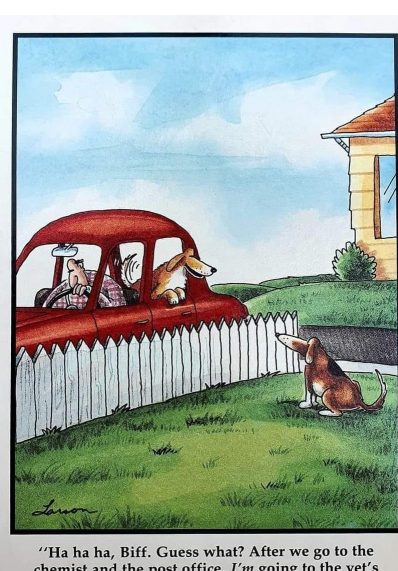
chemist and the post office, I'm going to the vet's to get tutored.''