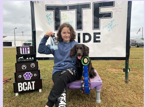
Earned her BCAT title