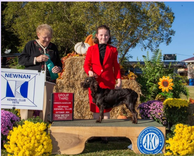
NOHS Group 3 placement Newnan KC