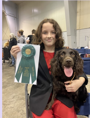
NOHS Group 3 placement Furniture City KC